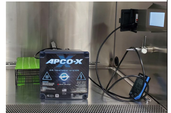
APCO-X™ in Test Chamber

coil and airborne disinfection) for commercial and healthcare applications, and APCO-X™ (HVAC coil and airborne disinfection with VOC/odor reduction) for both residential and commercial applications. Phase-2 testing is currently underway.